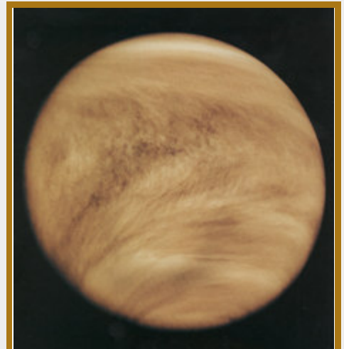
NASA's Pioneer Venus probe captured this image of Venus' perpetual cloud layer in 1979.

Venus sluggishly rotates on its axis once every 243 Earth days, while it orbits the Sun every 225 days - its day is longer than its year! Besides that, Venus rotates retrograde, or "backwards," spinning in the opposite direction of its orbit around the Sun. From its surface, the Sun would seem to rise in the west and set in the east.